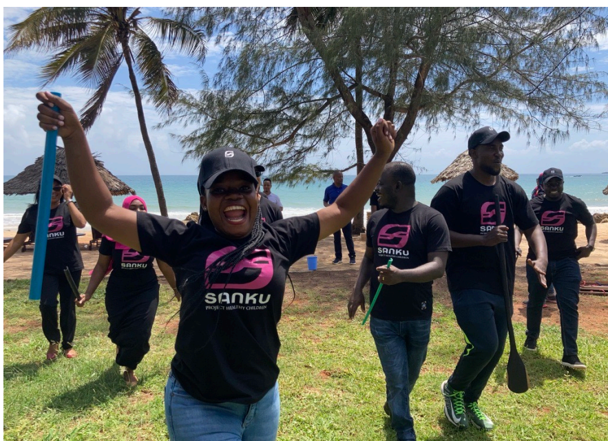
Sanku's winning team, laughing, playing, bonding.