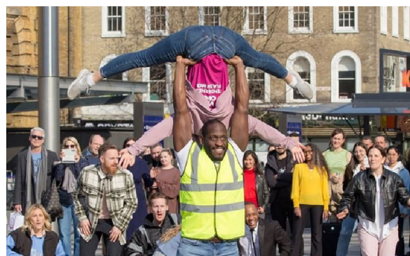
Fancy a Dance?

The wonderful Club Mob - a group of UK-based professional dancers - organised a fundraising campaign to celebrate the end of lockdown, raise awareness about Sanku and our work to end malnutrition. On a fun-filled Sunday, over 100 people came together to participate in four flash mobs at four incredible London locations. Virtual participants were also invited to join in the fun. Dancers from all over the world (including our very own staff in Tanzania and Kenya) shared their virtual moves as part of the biggest flash mob ever organised by Club Mob. The video has had over 60,000 YouTube views - you can watch it here ! Be warned, it will put a massive smile on your face!